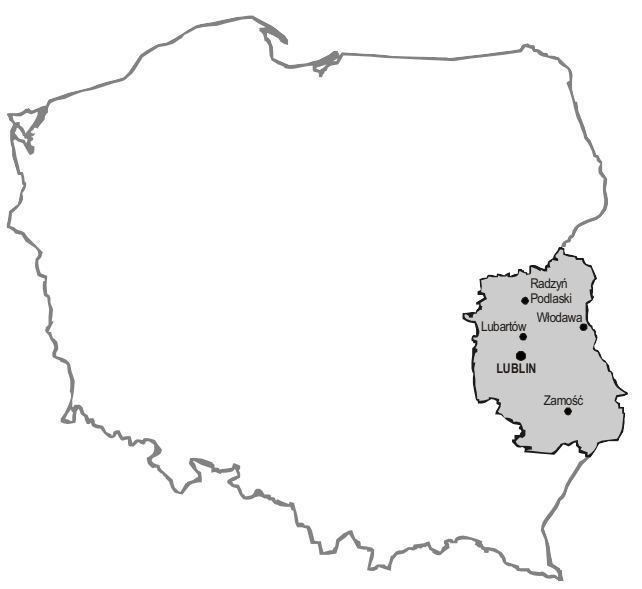
Figure 1. The area of study. Shadowed area: The territory of Lublin region. Circles: main towns of districts.

Examination of ticks for the presence of DNA of Borrelia burgdorferi sensu lato by polymerase chain reaction (PCR). 550 ticks collected from the districts of Lublin (362 specimens), Włodawa (84 specimens) and Zamość (104 specimens) were analysed for Borrelia